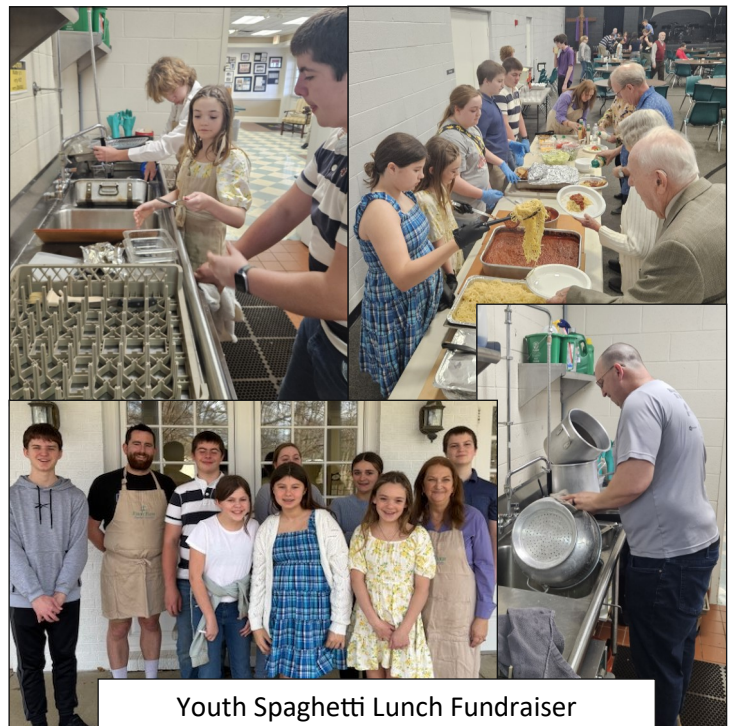
Youth Spaghetti Lunch Fundraiser

Thank you again for your continued prayers and support of our youth ministry. It truly makes a difference!